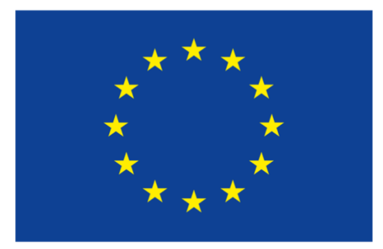
Co-financed by the Connecting Europe Facility of the European Union

The contents of this publication are the sole responsibility of the MyAcademicID consortium and do not necessarily reflect the opinion of the European Union